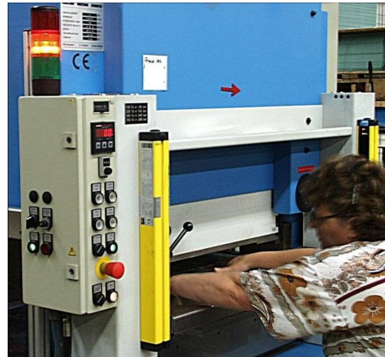
A press safeguarded by a light curtain

Finger and hand protection and safeguarding of danger zones on machines such as presses, pick-and-place machines, wood and paper processing and printing machines, and machines for use in warehousing and handling applications.