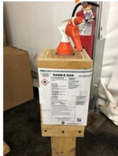
Portable Hand Sanitizer Station