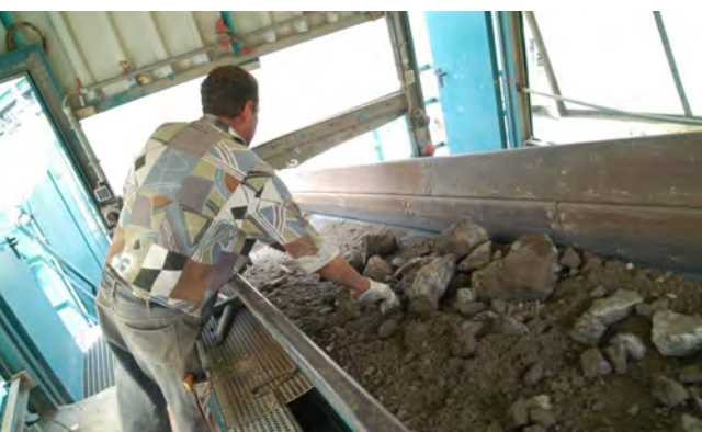
Sorting construction material recycling bears risks.

Crushing is a specific operation in widespread use in manufacturing or treatment processes in many industrial sectors. Its purpose varies according to the branch of activity in which it is employed.