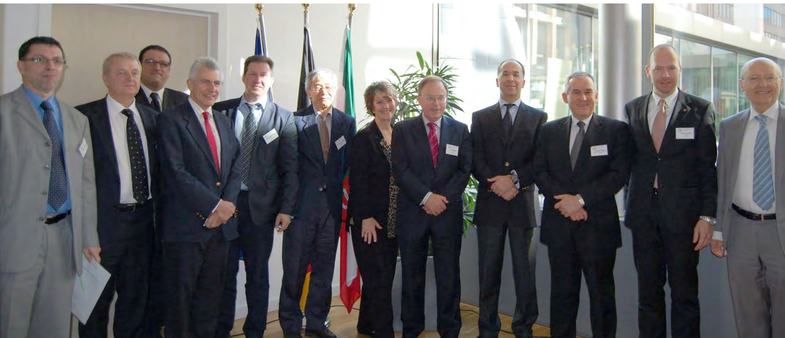
The initiators of the 5th Atlantic Alliance Conference.

All presentations and a full report available on www.quarry-safety.net