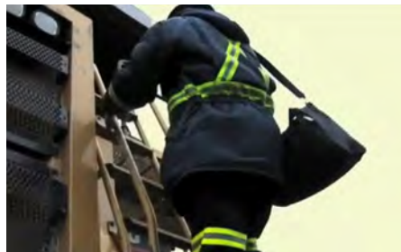
All That Glitters – Movie still.

For a safer, healthier and more productive place to work: the European