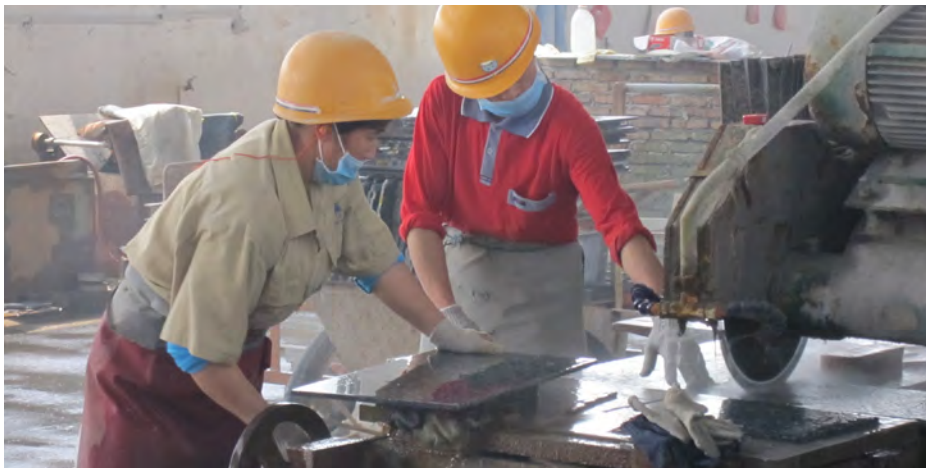
Workers in Fujian equipped with Personal Protective Equipment (PPE) are cutting flagstones.

Mutual respect, a common dialogue and transparency are essential criteria for Fair Stone. A transparent documentation is necessary to know what is happening on supplier's side and to show other stakeholders the efforts which have been achieved.