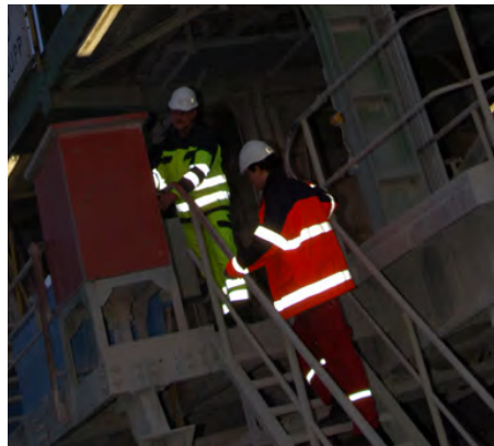
Working in shifts is common practice in the mining industry.

The researchers found that men working night shifts and women