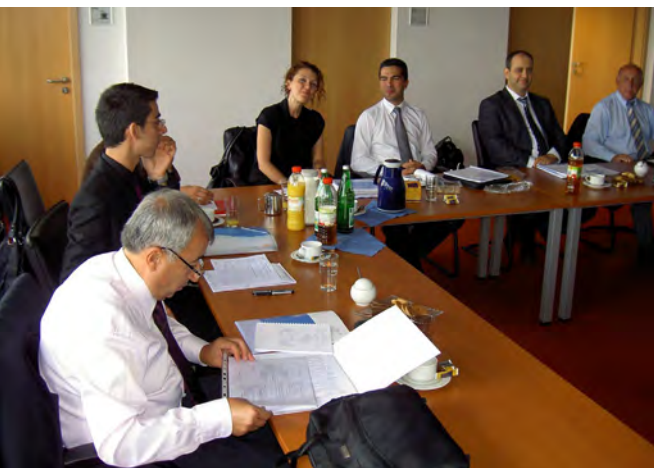
The workshop "Occupational Health Service in Germany".

The delegates were very interested in the training of work safety experts. The next great challenge in Turkey is to design a nationwide system, that would be able to inspect and advise all SME's all over the country.